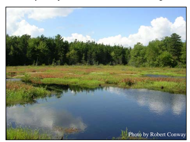
The wetland plants living in the wet soils around ponds, rivers, bogs, and vernal pools are just one of the natural resources protected by wetland laws.

All regulations, whether written for Building Inspectors, Health Departments, or Conservation Commissions, are written to be understood by those most likely to use them. For the state wetland regulations, the most likely users of the regulations are engineers and environmental consultants. It is true that at all levels of government, environmental regulations have become lengthier with detailed and specific criteria and "performance standards." This trend has occurred in part to reduce litigation and charges that decisions are either "arbitrary or capricious," and to ensure that regulations