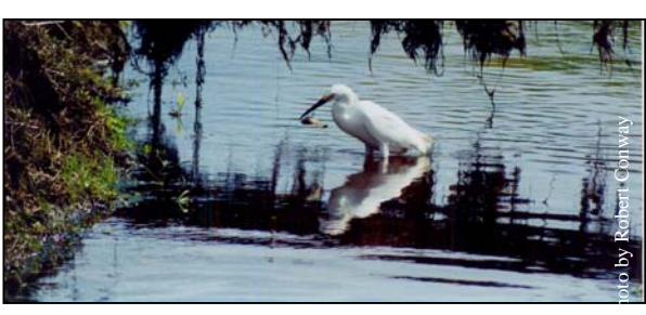
Constructing a dock requires local, state, and federal permits. Docks on a Great Pond also require a DEP Chapter 91 license. Photo: snowy egret feeding.

Site plans of proposed work near wetlands must include the locations of wetland boundary flags (placed by a trained wetlands biologist), the 100-foot wetland buffer zone, the 65-foot setback, and any other wetland resources present. Conservation Commission members and staff will visit the site of the proposed work and determine whether the proposed wetland boundary meets the state and local regulations. Boundaries are based on the presence of wetland plant species and soil types. The Commission may request the wetlands boundary be changed on a site plan.