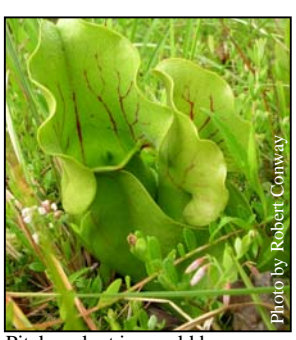
Pitcher plant in an old bog

sources and watershed resources in their town. Activities include preparing conservation and passive outdoor recreation plans and acquiring land to meet the conservation and passive recreation needs of their town. Commissions may also receive gifts of land, and town meeting may appropriate funds for the