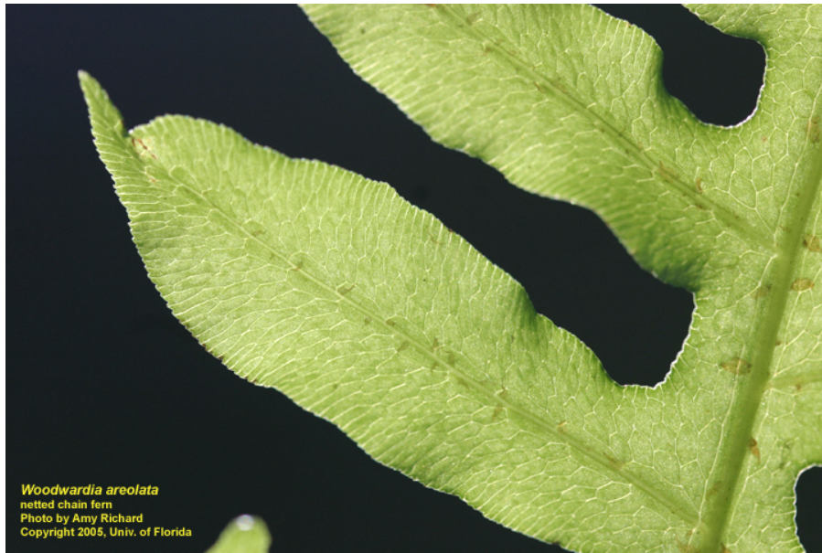
Woodwardia areolata netted chain fern