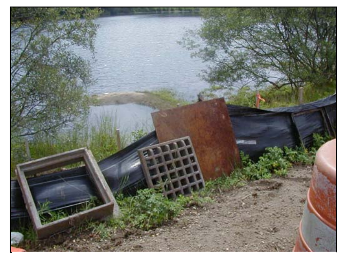
Fig. 1. Steel plate used to cover catchbasins near Sols Pond.

In June 2003, DEP reissued its 1997 manual titled "Massachusetts Erosion and Sediment Control Guidelines for Urban and Suburban Areas: A Guide for Planners, Designers, and Municipal Officials." Attached to this letter are pages 93-102 from that document which discusses appropriate inlet protection techniques.