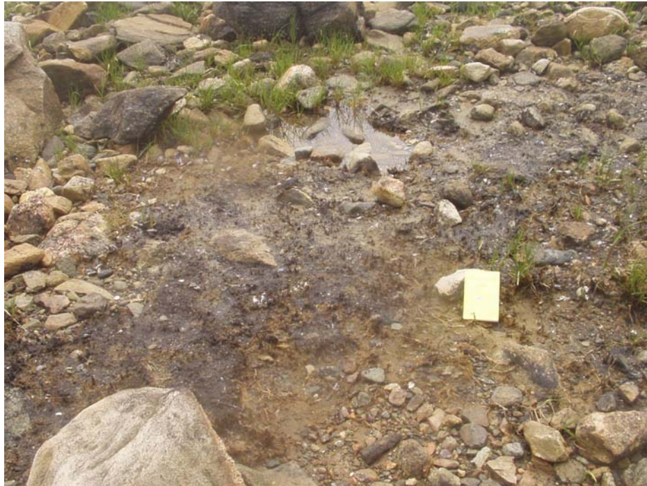
1. Residual pavement near marsh area.