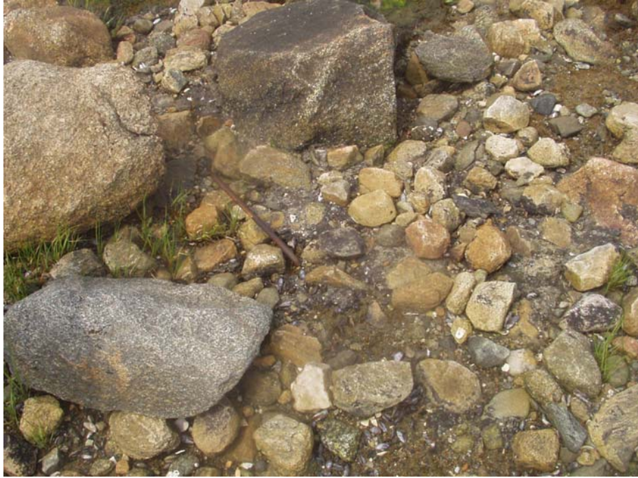
5. Residual pavement.