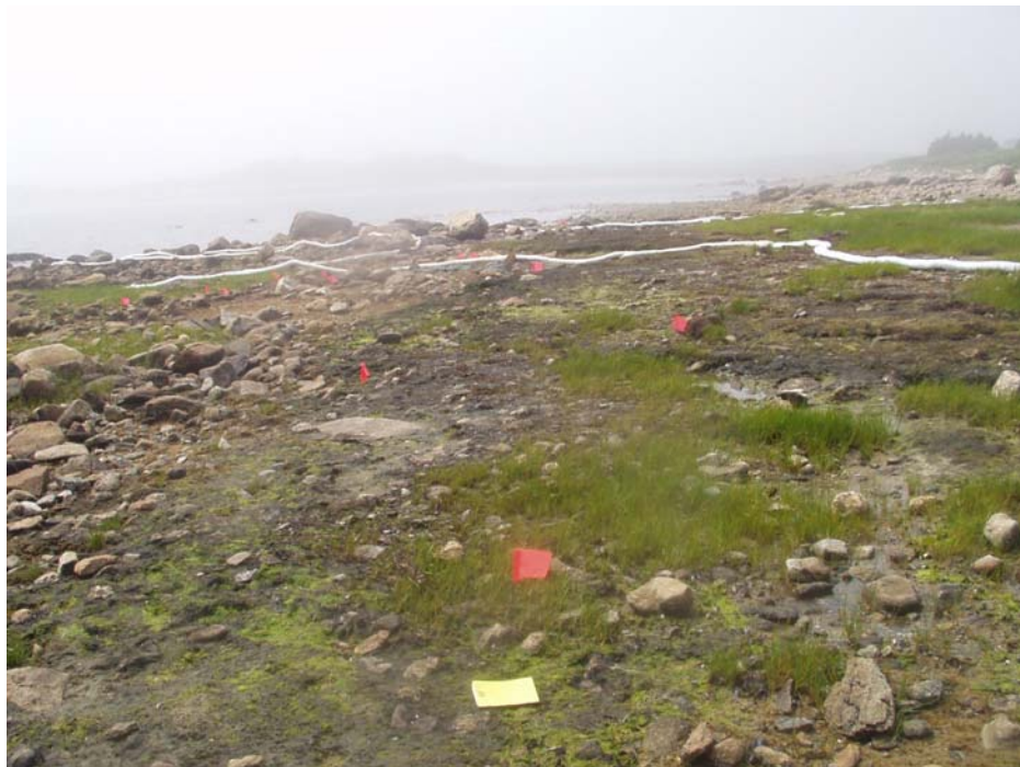
4. Proposed work area.