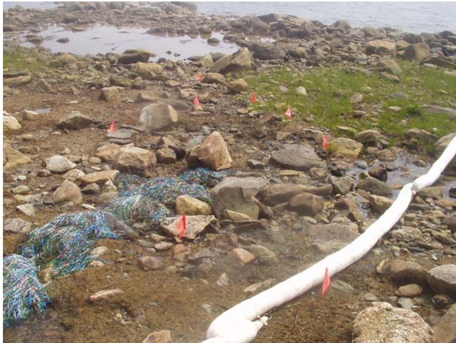
3. Proposed work area.