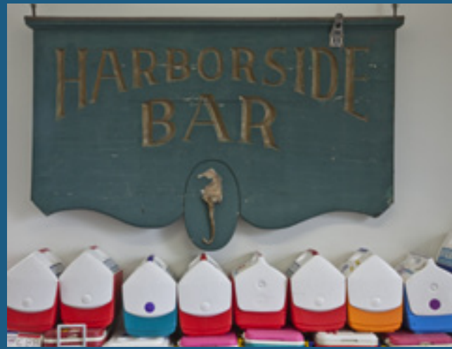
In a room that was once New Bedford's well-known Harborside Bar, coolers in the David Emerson Riggs Laboratory now serve the Coalition's Baywatchers Monitoring Program.

The meeting room supports The Coalition's outreach and education efforts by hosting workshops, lectures, and meetings and it is also available for rental by community groups. Adjacent to the meeting room is the Henry Wheeler Library, a growing resource of all things Buzzards Bay including scientific journals, reports, popular literature, maps, nautical charts, and more.