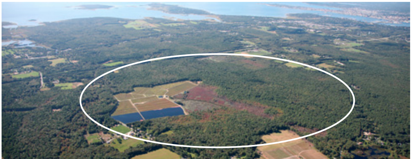
The 500+ acres of forest, wetland and cranberry bogs surrounding Tripps Mill Brook in Mattapoissett and Fairhaven were the Coalition's top priority for protection along the Mattapoissett River in 2010.

■ Upstream on the Mattapoissett in Rochester, we also used the Revolving Fund to “pre-acquire” 54 acres of forest and wetlands for the Town of Marion Water Department for drinking water supply protection. This property abuts other properties previously protected by the Coalition and creates a 325 acre block of contiguous protected land along the river. The Coalition will hold a conservation restriction on the property in order to permanently protect it for water quality, wildlife and outdoor recreation.