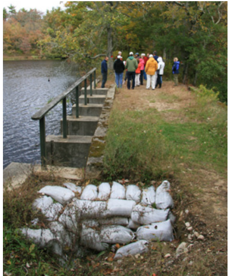
A temporary patch in the failing Hathaway Dam on the Sippican River. The Coalition is moving forward with plans to remove this dam and restore natural fish passage and habitat in the river.