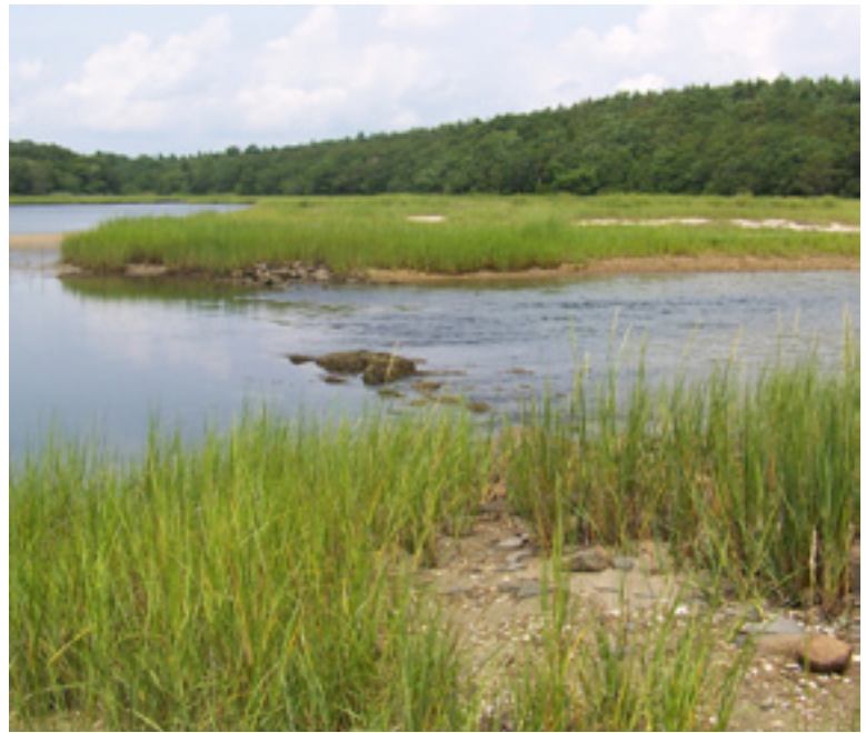
Bass Creek at the head of Widows Cove in Wareham is now permanently protected due to the Wareham Land Trust and the Massachusetts Audubon Society's purchase of the Sacred Hearts Retreat Center in 2010.

Many Bay rivers are clogged with old dams that disrupt natural processes, including the movement of fish migrating to and from the Bay. The Sippican River in Marion and Rochester has two such dams. In 2010, the Coalition supported the Town of Rochester, Alewives Anonymous and the Massachusetts Division of Marine Fisheries in the construction of an improved fish ladder at the Leonard Pond Dam. Meanwhile, with a grant from American Rivers, we contracted a specialized engineering firm to analyze how to address the crumbling and dangerous Hathaway Pond Dam. The analysis indicated that removing the dam entirely is the most cost effective and environmentally beneficial option and that it would not harm adjacent cranberry bog operations. We are now moving forward with a plan to acquire the property and take down the failing dam.