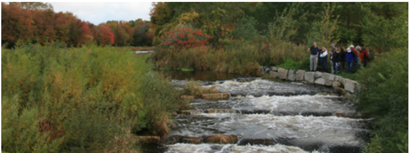
Coalition for Buzzards Bay Board and Staff survey the progress of our river restoration efforts at the Acushnet Sawmill.