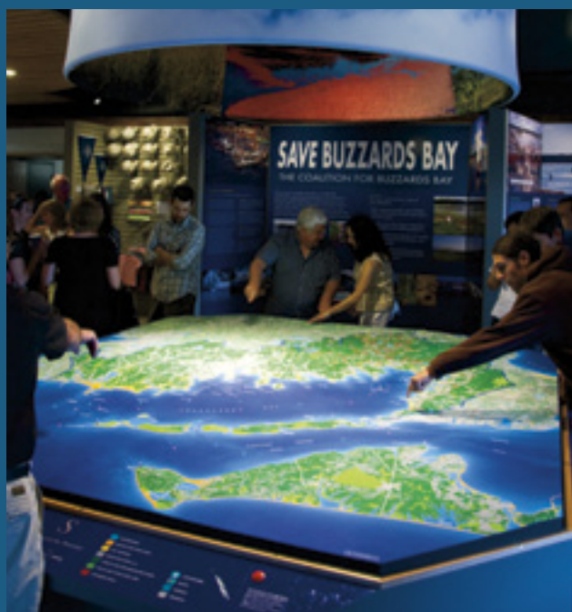
People gather around the 3D watershed model of Buzzards Bay at the public Open House.

More important is what's happening inside. The building's prime location in the New Bedford Whaling National Historical Park provides a tremendous opportunity for The Coalition to engage the hundreds of thousands of visitors to the city each year. The connection starts in the Richard C. Wheeler Bay Learning Center which contains interactive exhibits and informational displays including a 3D model of the Buzzards Bay watershed. The center