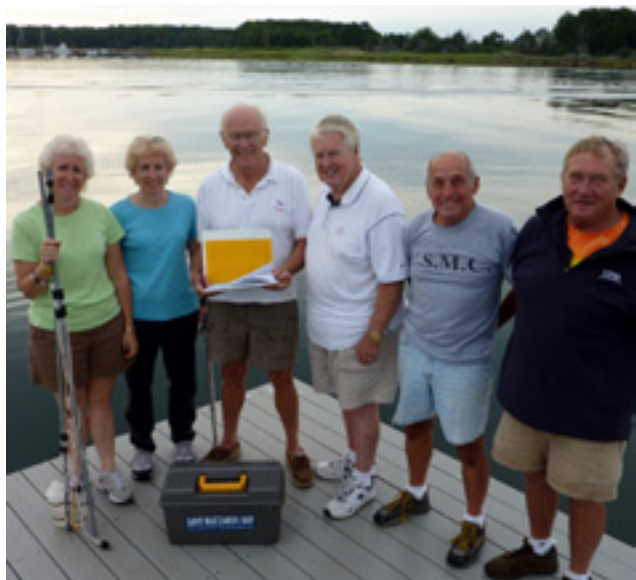
The 2010 Pocasset Harbor Baywatchers Team. Contact the Coalition to become a volunteer Baywatchers in your favorite harbor.

■ Coalition staff and volunteers also monitored the health of important Bay tributary streams with river flow and temperature gauges on the Mattapoisett and Acushnet Rivers.