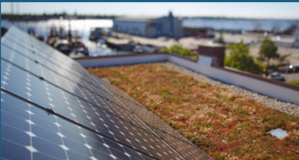
The Buzzards Bay Center's vegetated roof reduces storm water runoff into the harbor; solar panels provide clean electricity to the offices below.

The fourth floor, with views of Buzzard Bay, contains a public meeting room with state-of-the-art A/V technology, a floor to ceiling map of the watershed and artwork inspired by Buzzards Bay including the sculpture "Abundance" by John Mangan which contains over 100 fish carved from original building beams recovered during construction.