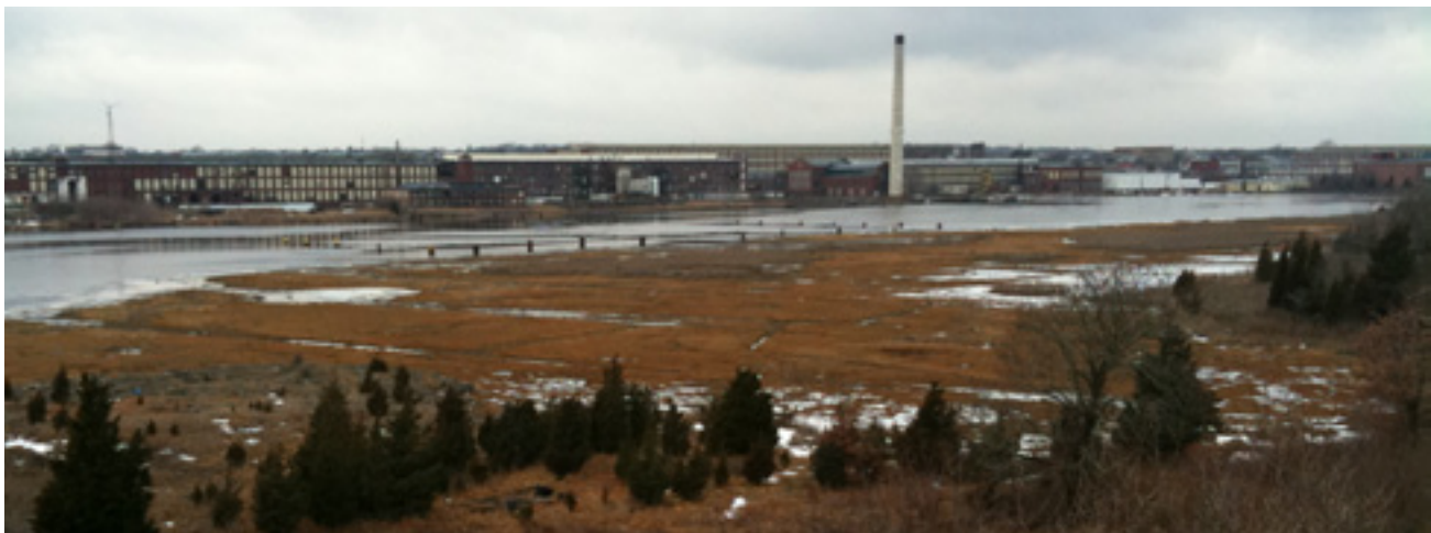
The Coalition is working to permanently preserve the undeveloped eastern shore of the Acushnet River Estuary.

■ And up at the headwaters of the Acushnet River in Freetown, we completed construction of a trail head access and parking area on the 85-acre Dietlin Woods property that we helped the Fairhaven Acushnet Land Preservation Trust acquire in 2007. Visitors are invited to park and explore the forest, fresh water marsh and brook in this quiet corner of the watershed.