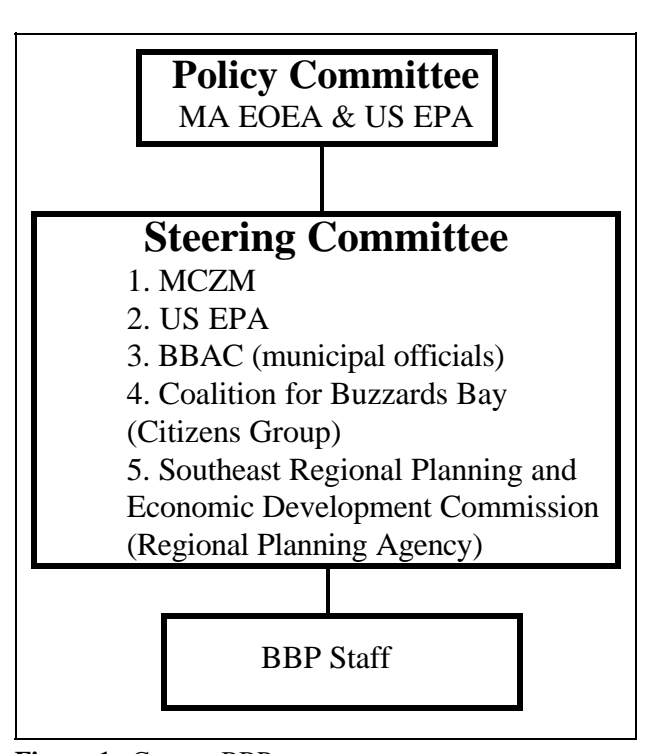
Figure 1. Current BBP structure.

With the completion of the Management Plan in 1991, the Management Committee replaced itself with a 5-member Steering Committee composed of those parties most interested in ensuring implementation of the Management Plan. These members were Massachusetts Coastal Zone Management (CZM), the US EPA, the Southeast Regional Planning and Economic Development District and two