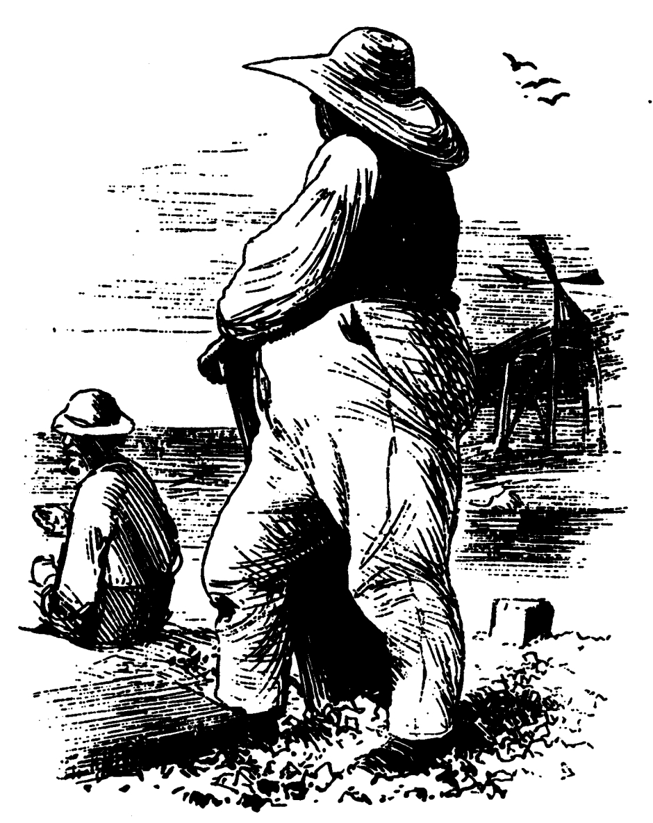
THE SKIPPER OF MARION.