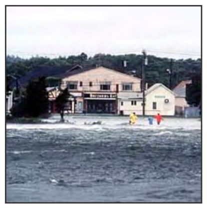
In 1985, during hurricane Gloria it was hard to tell the difference between Main Street, Buzzards Bay, and the bay itself.

Because of Bourne's location on the ocean between Cape Cod Bay, and Buzzards Bay, it is at high risk for hurricanes and other types of severe storms which carry high winds