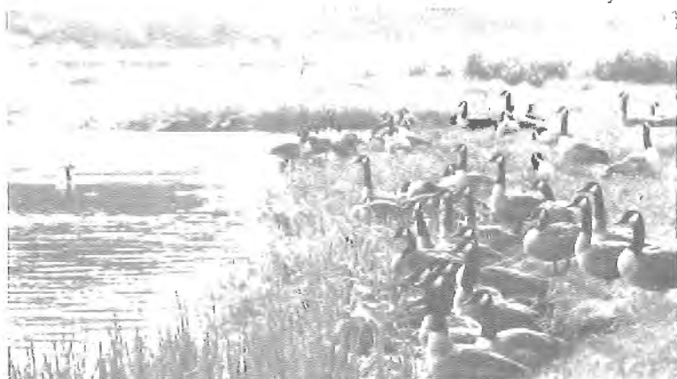
Waterfowl can be a major source of pollution.